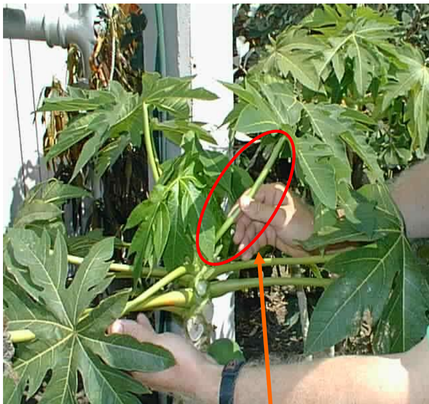
Petiole of first fully expanded leaf

Take the youngest fully expanded leaf out from the crown, and remove the petiole (leaf stalk). It is the plant part to be tested.