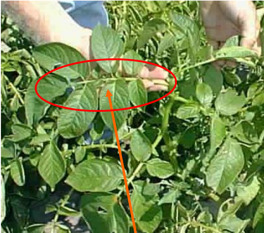
First fully expanded leaf

Take first fully expanded leaf - usually the fourth or fifth leaf back from the growing point of the plant. The compound leaf is formed of several/many smaller leaflets - BE SURE TO TAKE WHOLE LEAF & STEM (petiole), not just the leaflets.