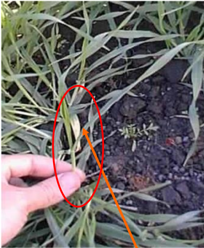
Leaf with visible dewlap

Sample the first fully expanded leaf and sheath with a visible dewlap. This part is sampled up until the flag leaf emerges.