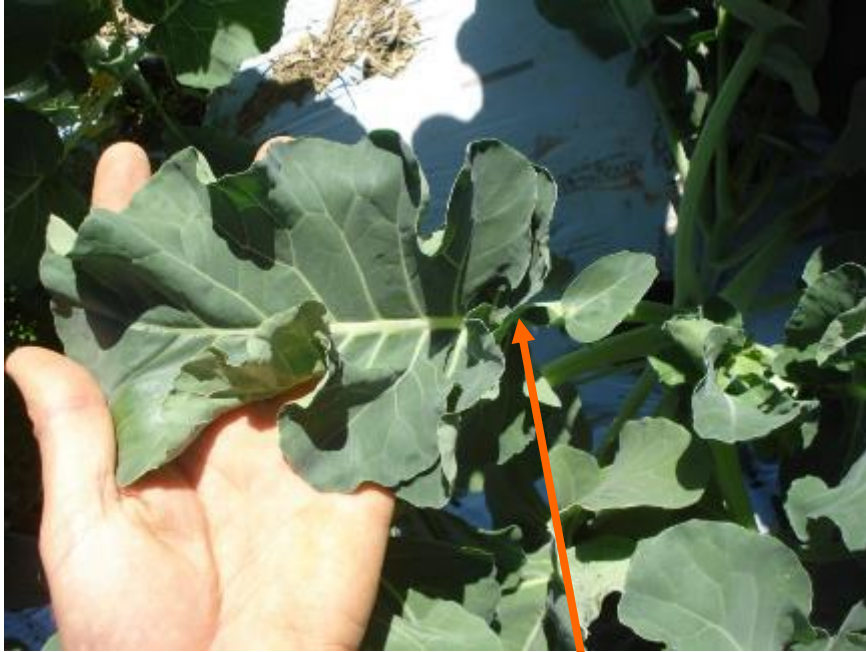
1st fully expanded leaf

Take first fully expanded leaf out from the growing point of the plant.