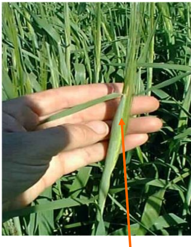
Flag Leaf, final leaf before grain head

Sample the flag leaf and sheath down to the last node. The flag leaf will be the final leaf that emerges before the grain head emerges.