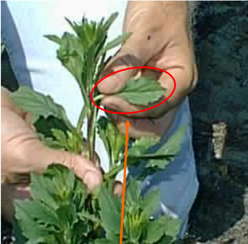
1st fully expanded leaf

Take first fully expanded leaf - usually the fourth or fifth leaf back from the growing point of the plant. BE SURE TO TAKE WHOLE LEAF & STEM (petiole), not just the leaf blade.