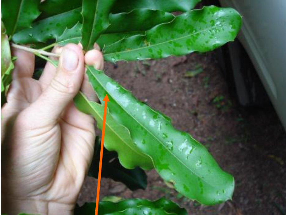
First fully expanded leaf

Take the first fully expanded leaves on the latest flush. Make sure to sample the leaf with its stem (petiole).