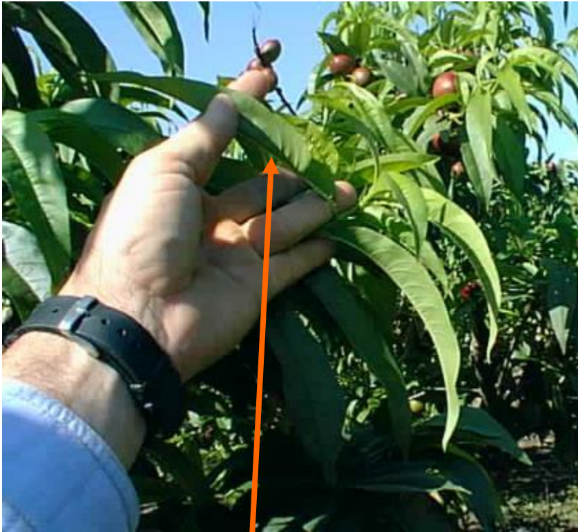
1st fully expanded leaf

Sample non-fruiting terminals only. Take leaves that are fully expanded on the latest flush.