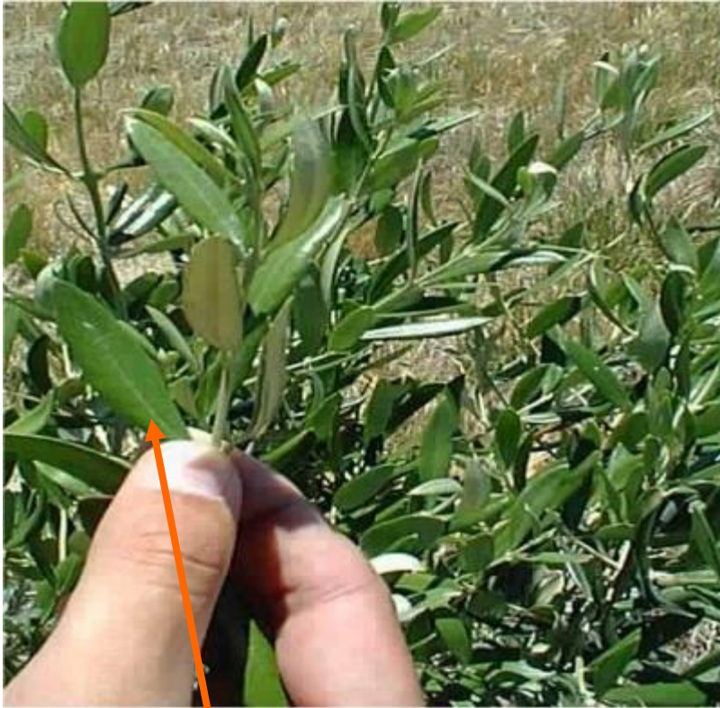
1st fully expanded leaf

Sample non-fruiting terminals only. Take leaves that are fully expanded on the latest flush.