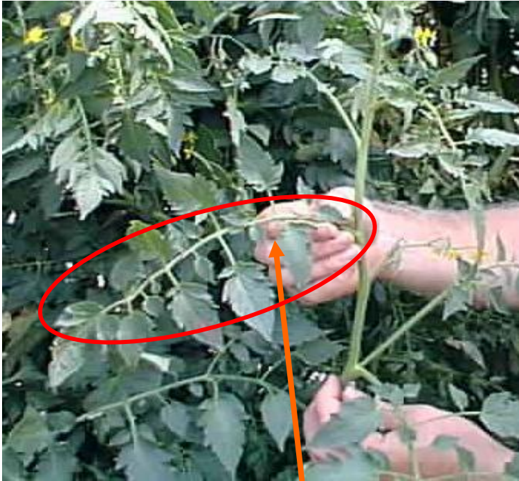
1st fully expanded leaf

Take first fully expanded leaf - usually the fourth or fifth leaf back from the growing point of the plant. The compound leaf is formed of several/many smaller leaflets - BE SURE TO TAKE WHOLE LEAF & STEM (petiole), not just the leaflets.