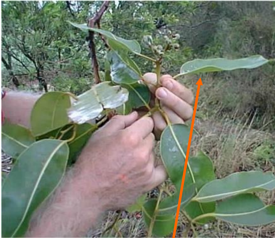
1st fully expanded leaf

Take leaves that are about \frac{3}{4} expanded on the latest flush.