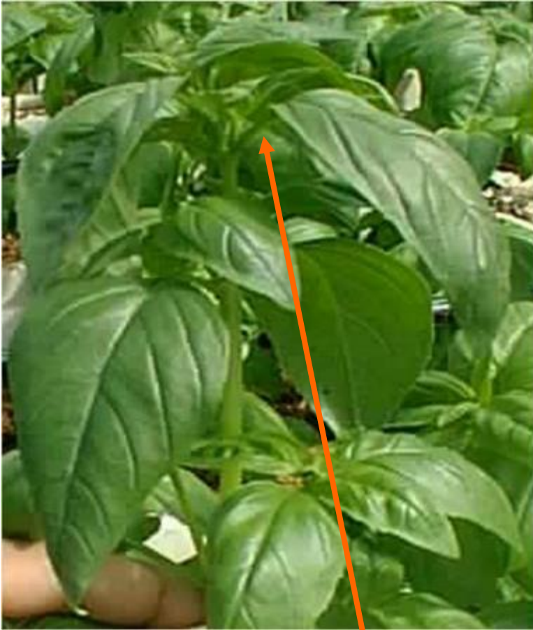
First fully expanded leaf

Take first fully expanded leaf - usually the fourth leaf back from the growing point of the plant. BE SURE TO TAKE WHOLE LEAF & STEM (petiole), not just the leaf blade.