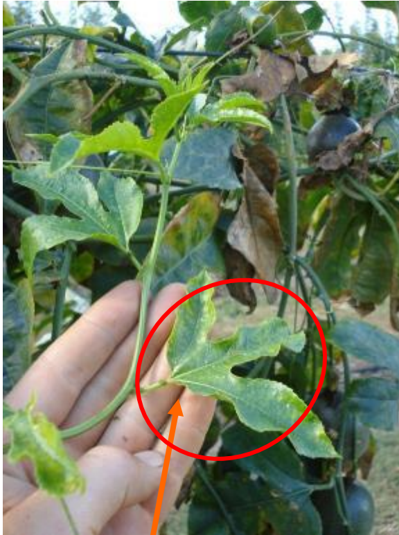
1st fully expanded leaf

Take first fully expanded leaf - usually the fourth or fifth leaf back from the growing point of the runner. BE SURE TO TAKE WHOLE LEAF & STEM (petiole), not just the leaf blade.