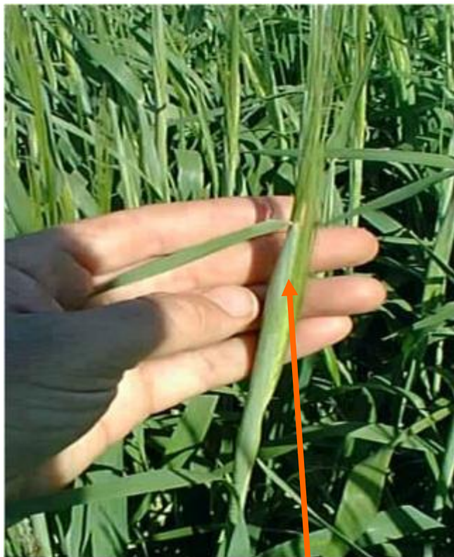
Flag Leaf, final leaf before grain head

Sample the flag leaf and sheath down to the last node. The flag leaf will be the final leaf that emerges before the grain head emerges.