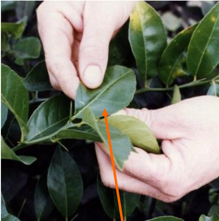
1st mature leaf of current flush

Sample non-fruiting terminals only. Take leaves that are about \frac{3}{4} expanded on the latest flush.