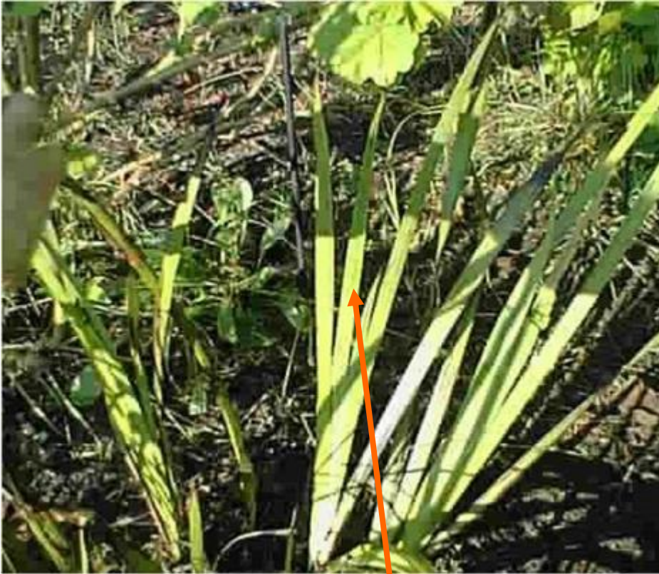
1st fully expanded leaf

Take first fully expanded leaf - usually the second or third leaf out from the growing point of the plant,.