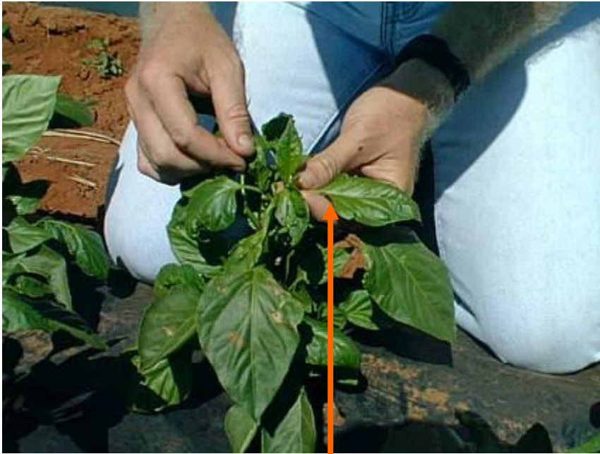
First fully expanded leaf

Take first fully expanded leaf - usually the fourth or fifth leaf out from the crown of the plant. BE SURE TO TAKE WHOLE LEAF & STEM (petiole), not just the leaf blade.