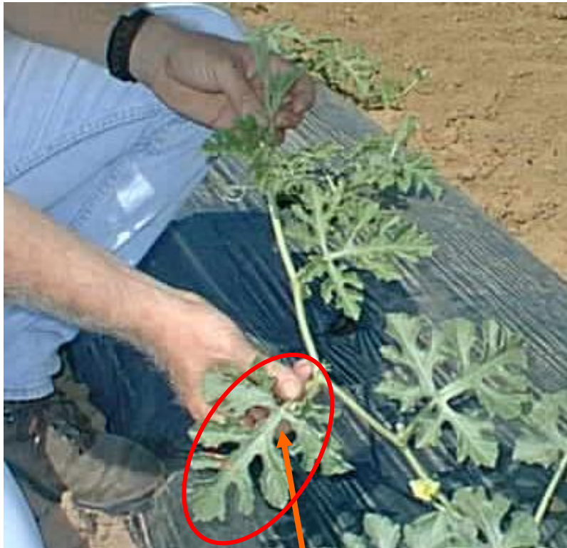
1st fully expanded leaf

First fully expanded leaf - usually the fourth or fifth leaf back from the growing point of the runner. BE SURE TO TAKE WHOLE LEAF & STEM (petiole), not just the leaf blade.