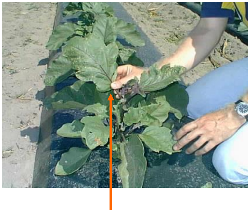
First fully expanded leaf

Take first fully expanded leaf - usually the fourth or fifth leaf back from the growing point of the plant, or out from the crown of the plant. BE SURE TO TAKE WHOLE LEAF & STEM (petiole), not just the leaf blade.