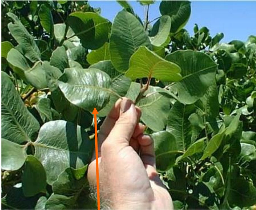
1st fully expanded leaf

Sample non-fruiting terminals only. Take leaves that are fully expanded on the latest flush.