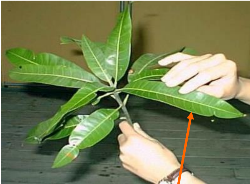
1st fully expanded leaf

Sample non-fruiting terminals only. Take leaves that are about \frac{3}{4} expanded on the latest flush. Make sure to sample the leaf with its stem (petiole).