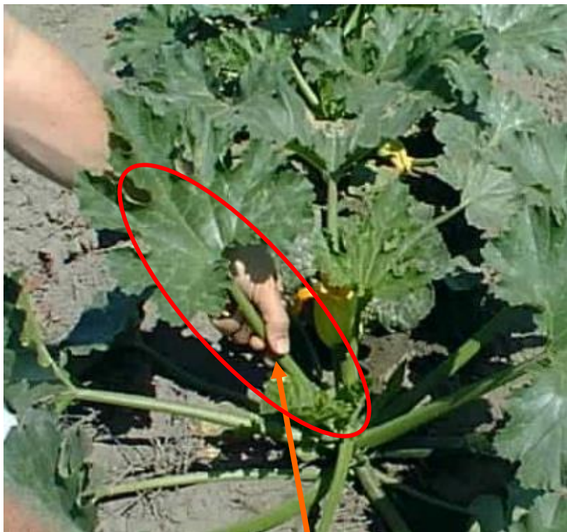
1st fully expanded leaf

Take first fully expanded leaf - usually the fourth or fifth leaf back from the growing point. BE SURE TO TAKE WHOLE LEAF & STEM (petiole), not just the leaf blade.