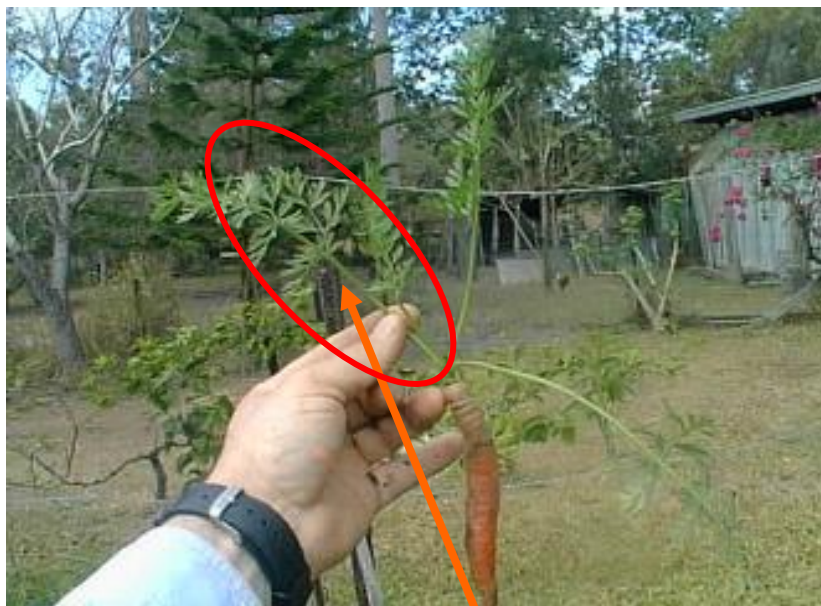
1st fully expanded leaf from growing point

Take first fully expanded leaf - usually the fourth or fifth leaf out from the growing point. Take the whole leaf including the petiole which starts on the top of the root.