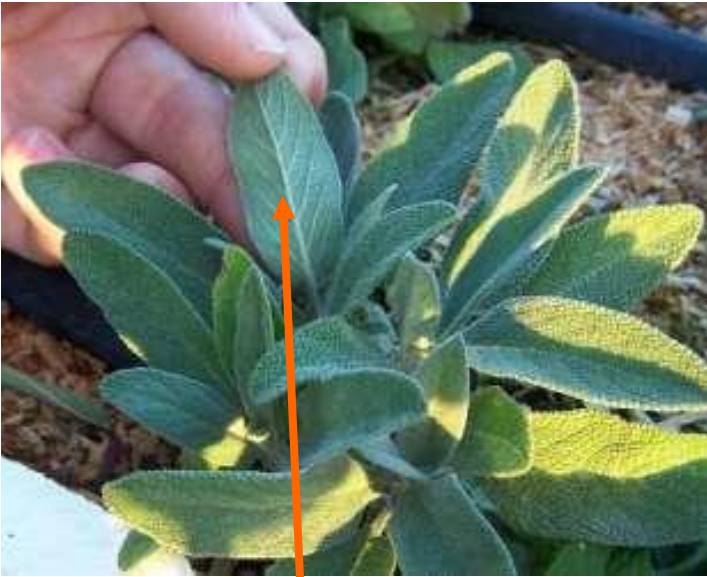
1st fully expanded leaf

Take first fully expanded leaf - usually the fourth or fifth leaf back from the growing point of the plant. BE SURE TO TAKE WHOLE LEAF & STEM (petiole), not just the leaf blade.