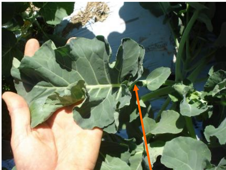
1st fully expanded leaf

Take first fully expanded leaf out from the growing point of the plant. BE SURE TO TAKE WHOLE LEAF & STEM (petiole), not just the leaf blade.