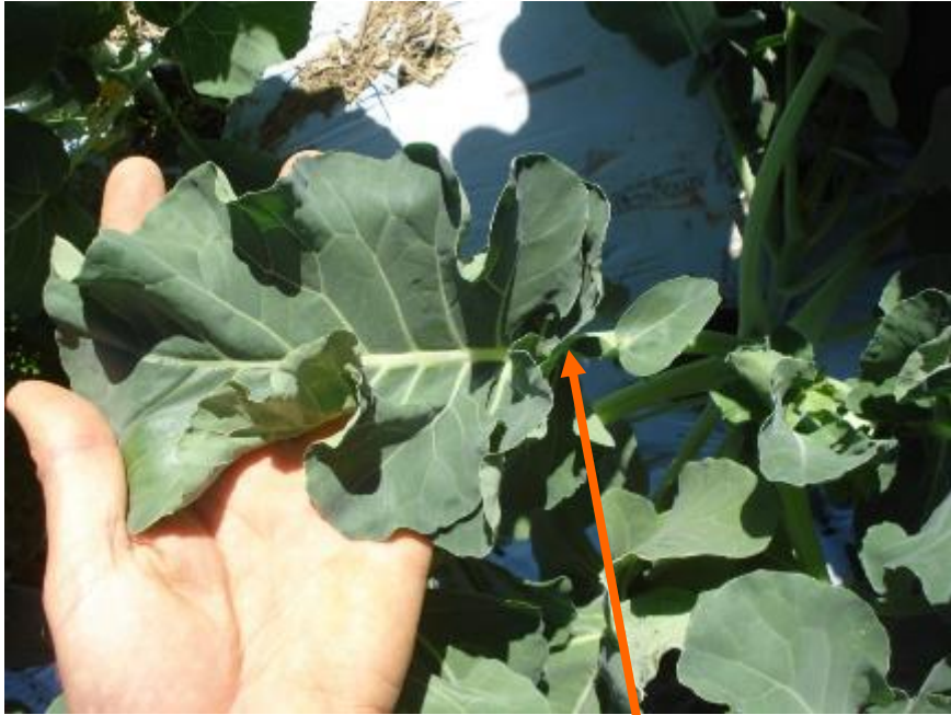
1st fully expanded leaf

Take first fully expanded leaf out from the growing point of the plant.