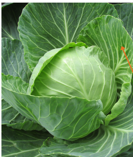
FIRST FULLY EXPANDED LEAF