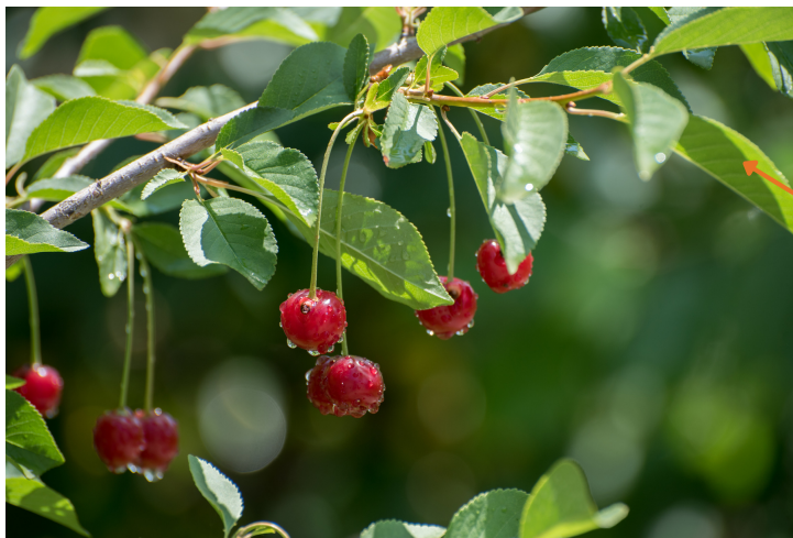
1ST FULLY EXPANDED LEAF