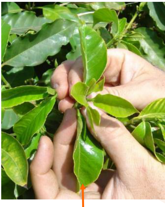
1ST FULLY EXPANDED LEAF