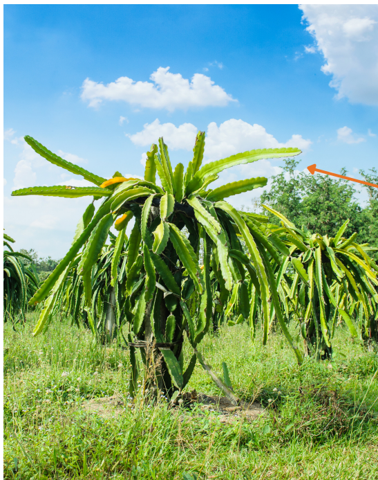
1ST FULLY EXPANDED LIMB