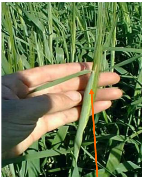
FLAG LEAF, FINAL LEAF BEFORE GRAIN HEAD