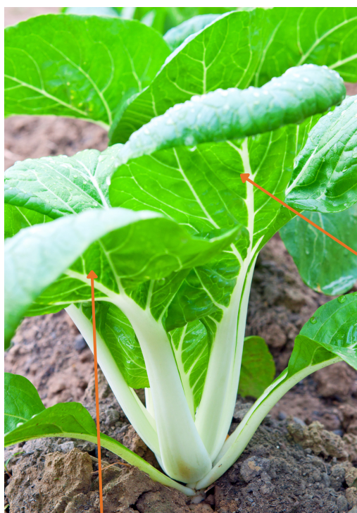
NEW LEAF (1ST FULLY EXPANDED LEAF)