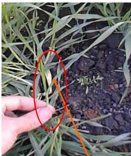
LEAF WITH VISIBLE DEWLAP