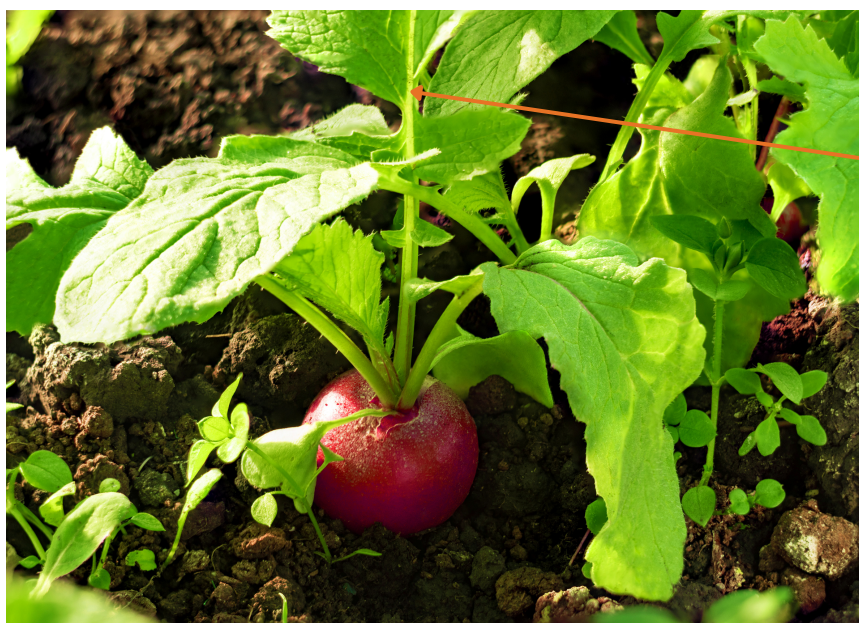
1ST FULLY EXPANDED LEAF FROM GROWING POINT

Begin sampling at five leaf stage, continue weekly or fortnightly until 2 weeks before harvest.