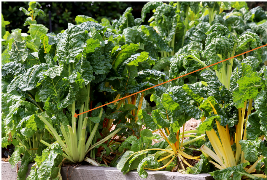
1ST FULLY EXPANDED LEAF FROM GROWING POINT

Begin sampling at five leaf stage, continue weekly or fortnightly until 2 weeks before harvest.