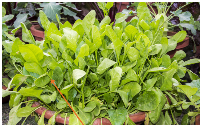
1ST FULLY EXPANDED LEAF