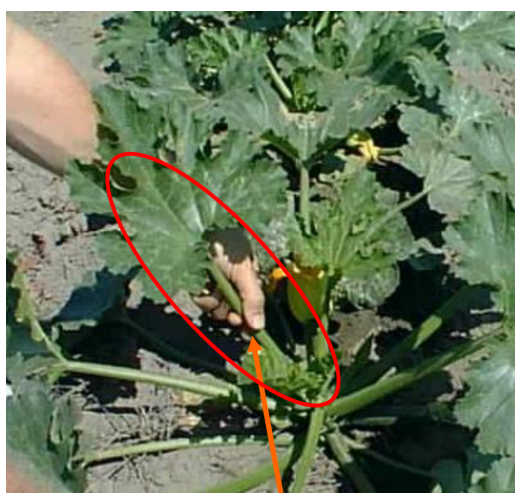
1ST FULLY EXPANDED LEAF

Begin sampling at pre-flowering stage, fortnightly or monthly to harvest, or sample by crop stage.