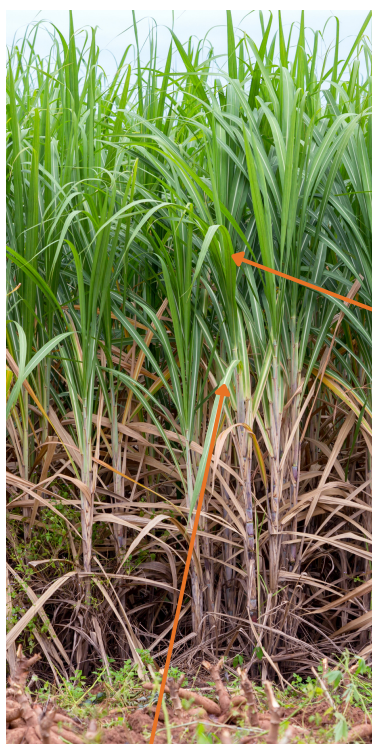
NEW LEAF (1ST FULLY EXPANDED LEAF)