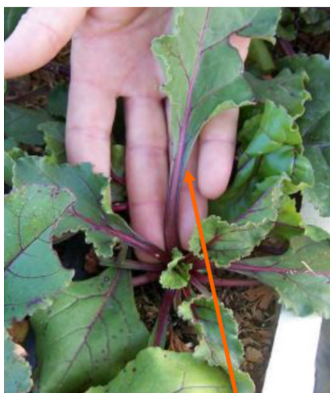
1ST FULLY EXPANDED LEAF FROM GROWING POINT