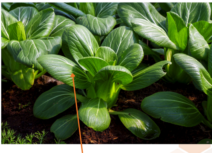
1ST FULLY EXPANDED LEAF