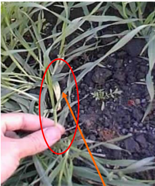
LEAF WITH VISIBLE DEWLAP